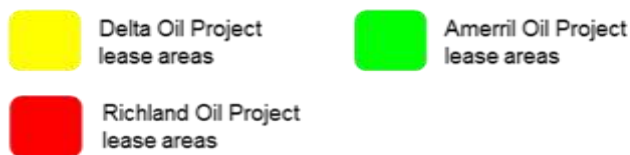
Figure 1: Sun Resources NL's Footprint in Leon County