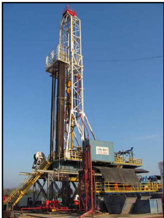
AD-1 Drilling Rig