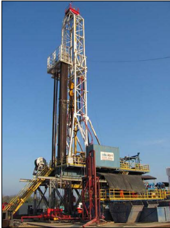
AD-1 drilling Rig