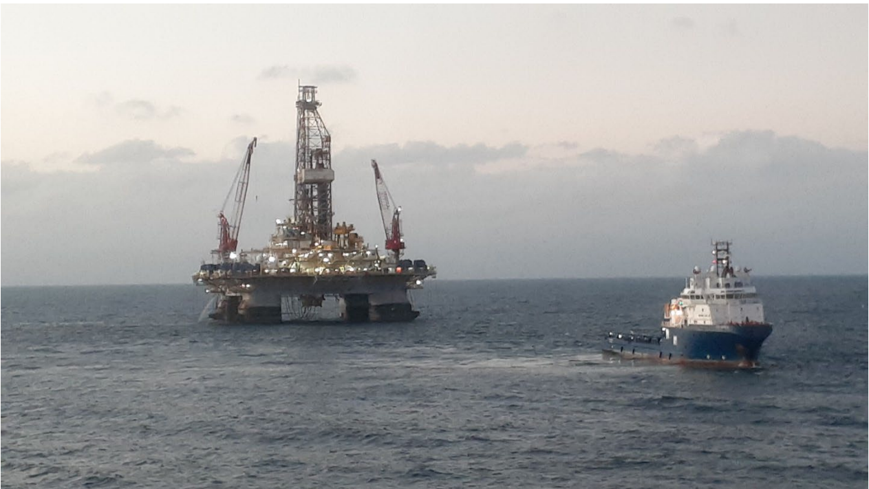
Valaris MS1 rig under tow to the Sasanof-1 exploration well location

Web: www.prominenceenergy.com.au Phone: +61 8 9321 9886 Email: admin@prominenceenergy.com.au